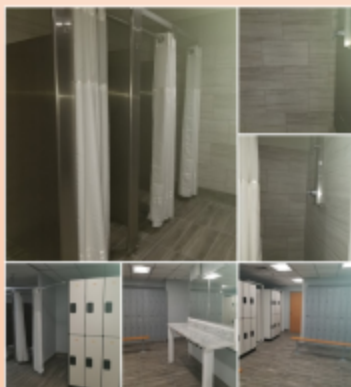
GIRL'S NEWLY RENOVATED LOCKER ROOM!

This years. Fall Fest with a Twist is being held on November 5th to benefit our much needed Gym renovations. Our children use the gym every day and there have been no repairs to it in many, many years. Without the use of the gym, it takes away part of our programming for the children. It is necessary and so important.